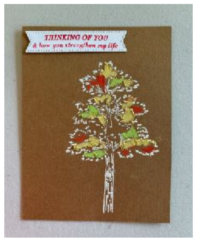
Chalk before it is blended.

5. Stamp the sentiment and cut out with the banner die. Adhere.